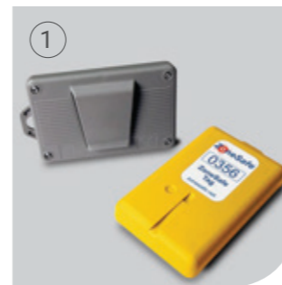
Grey Tags are for Pedestrians, Yellow Tags are for Drivers.

TufTags fit into safety cones or attach to metal surfaces using a magnet. Offering a simple and fast deployment solution to set up detection zones or 'no go' areas around an asset or hazard, TufTags protect during close vehicle movement.