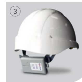
Helmet not included